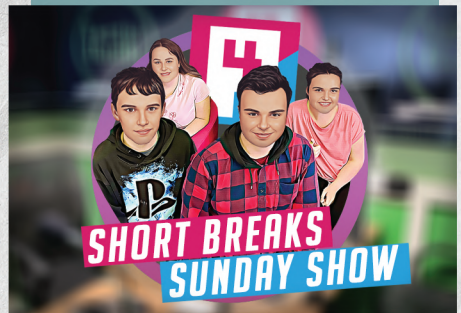
The Short Breaks team recently won a richly deserved Gold Award at the Community Radio Awards for 'Community Show of the Year.'