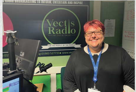
Vectis Radio's 'Talking Council' is regularly in contact with key members of the Isle of Wight Council to discuss important issues our listeners want to know about.

Vectis Radio also continues to support the Food Bank which it has done since 2011 with a free advertising campaign. We feel we have a moral duty to do so. Child poverty is a major problem on the Isle of Wight so we promote the needs of the food bank on a regular basis to help make sure stocks are replenished.