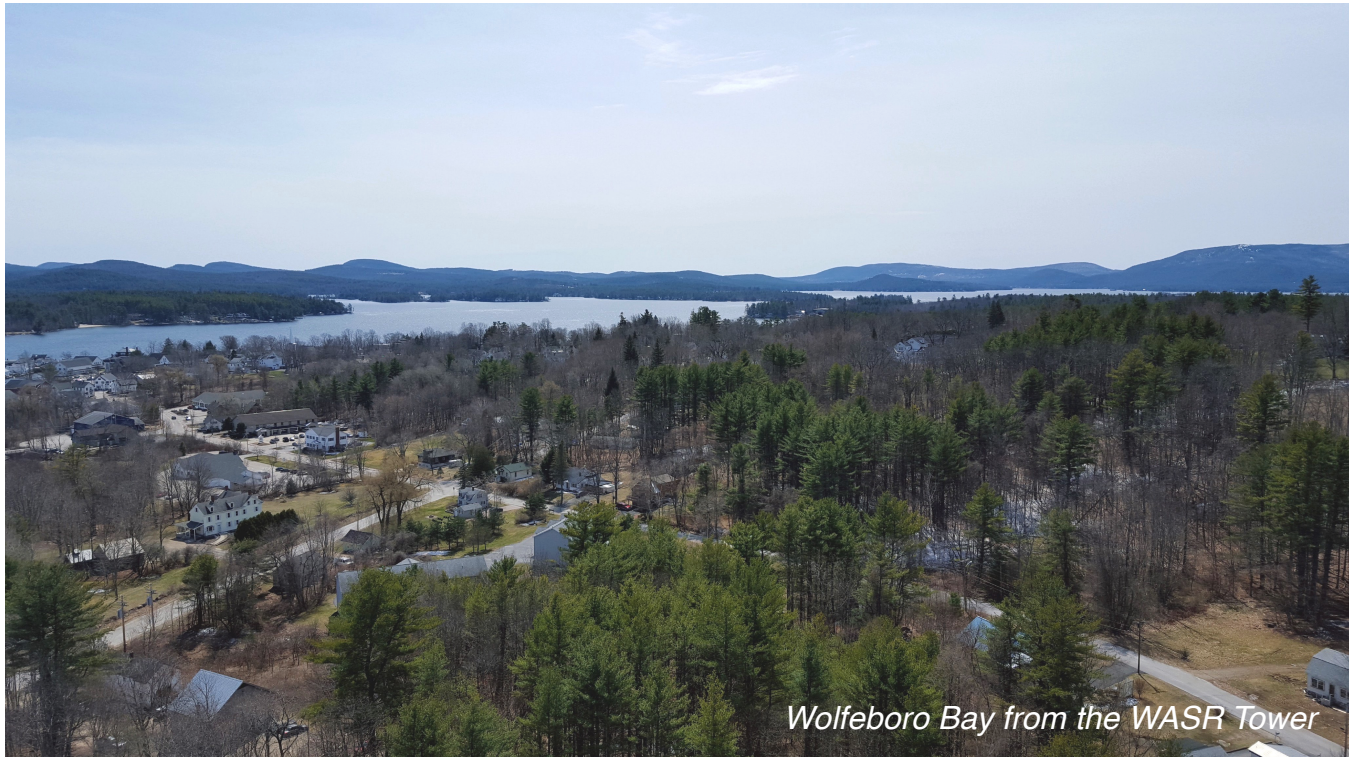
Wolfeboro Bay from the WASR Tower

Independent Radio Where Community Matters